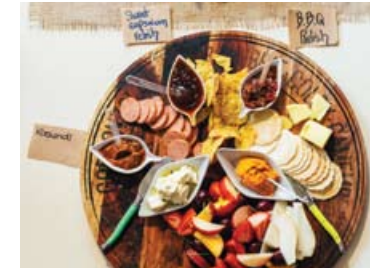
Yarra Valley Winery

The rolling green hills of the Yarra Valley have enticed visitors for over 150 years, and now it's your turn. Imagine yourself (and some friends) sipping on world-renowned wines of the red, white and sparkling varieties, as friendly winemakers welcome you to beautiful homesteads with gourmet, locally-grown food to accompany. Enjoy exploring Australia's premier wine region and indulge in sweet relishes, refreshing ciders and magical wines.