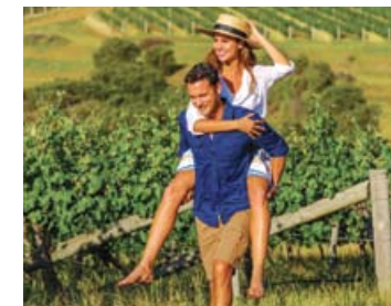
Dromana Beach Boxes

The Mornington Peninsula is Melbourne's maritime playground, with quiet bayside beaches on one side and the powerful southern ocean on the other. You'll be as enchanted by the peninsula scenery as you are by its wineries. From beautiful country farmhouses to the grandeur of wineries and the sweeping vistas of ocean and sky, your tour includes a complete selection of our favourite things; wine, cheese, chocolate and cider.