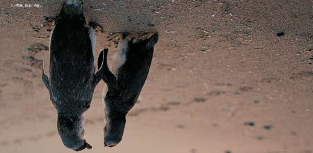
Phillip Island Penguins

Take a journey in comfort and style and experience our designer Phillip Island Day Tour. Our professional tour hosts provide door to door service from your hotel*, present in-depth information with a strong focus on intimate encounters with nature. Not just about the penguins, this beautiful island wonderland encompasses dramatic coastlines and range of native animals that you can get up close and personal with.