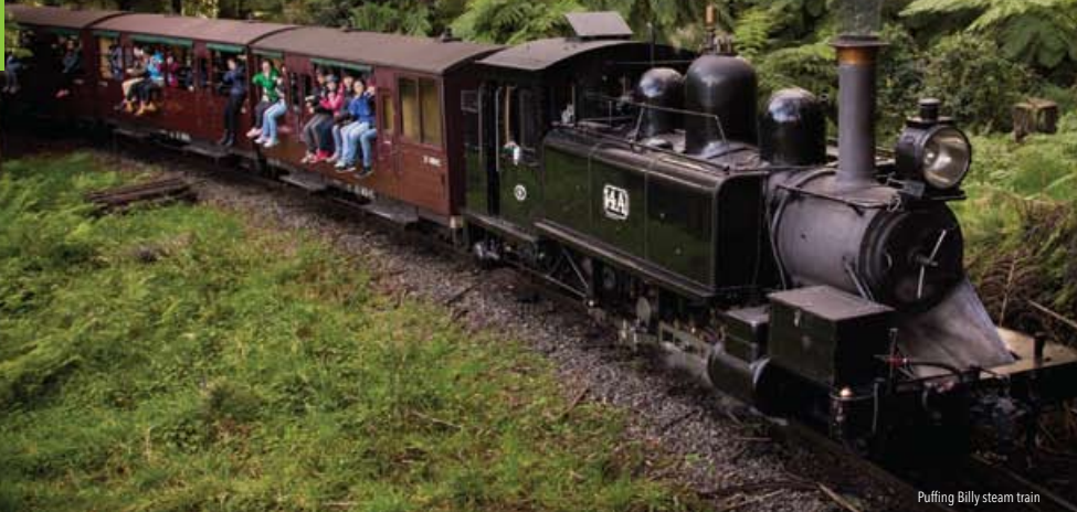
Puffing Billy steam train

Take a short ½ day break from the rush of busy city life. Journey east through the beautiful low mountain Dandenong Mountain Ranges. Ride this century-old steam train from Belgrave to Menzies Creek, where ferns grow wild and trees tower over hidden tracks, rolling hills, and steep valley forest. This region is home to the famous Puffing Billy Railway, numerous arts and craft stores and cafés offering delicious homemade products.