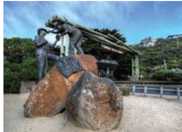
Koalas, Great Otway National Park

Explore the Great Ocean Road on a small-group, full day tour where stunning views, historic rainforests and expansive beaches will take your breath away. Discover the hidden beach of Loch Ard Gorge and view the iconic remarkable rock formations of the 12 Apostles. A great way to enjoy a day away from the busy streets of Melbourne in a relaxed and social atmosphere.