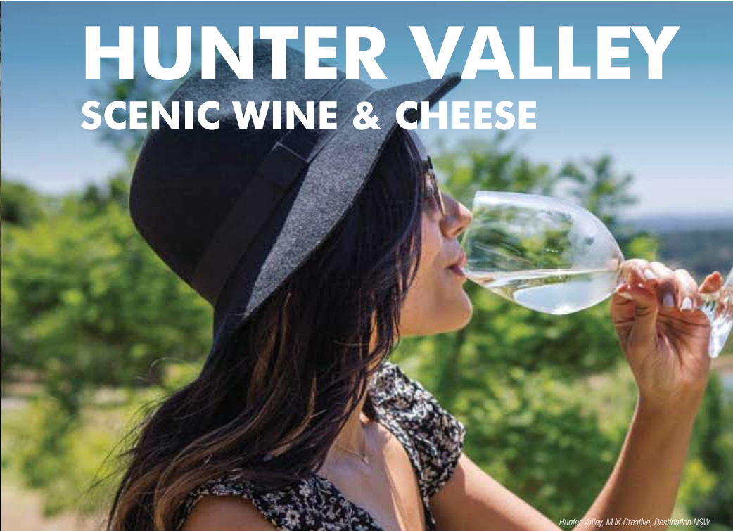
Hunter Valley, MJK Creative, Destination NSW

Sip, slurp and sample your way around the Hunter Valley on this interactive, entertaining and informative day tour! Departing Sydney we travel north toward the luscious fertile lands of the Hunter Valley, one of the most famous wine growing regions in Australia. Delight and tantalize your taste buds as we visit a variety of cellar doors and even stop off at a Cheese Shop to experience delicious local tastings.