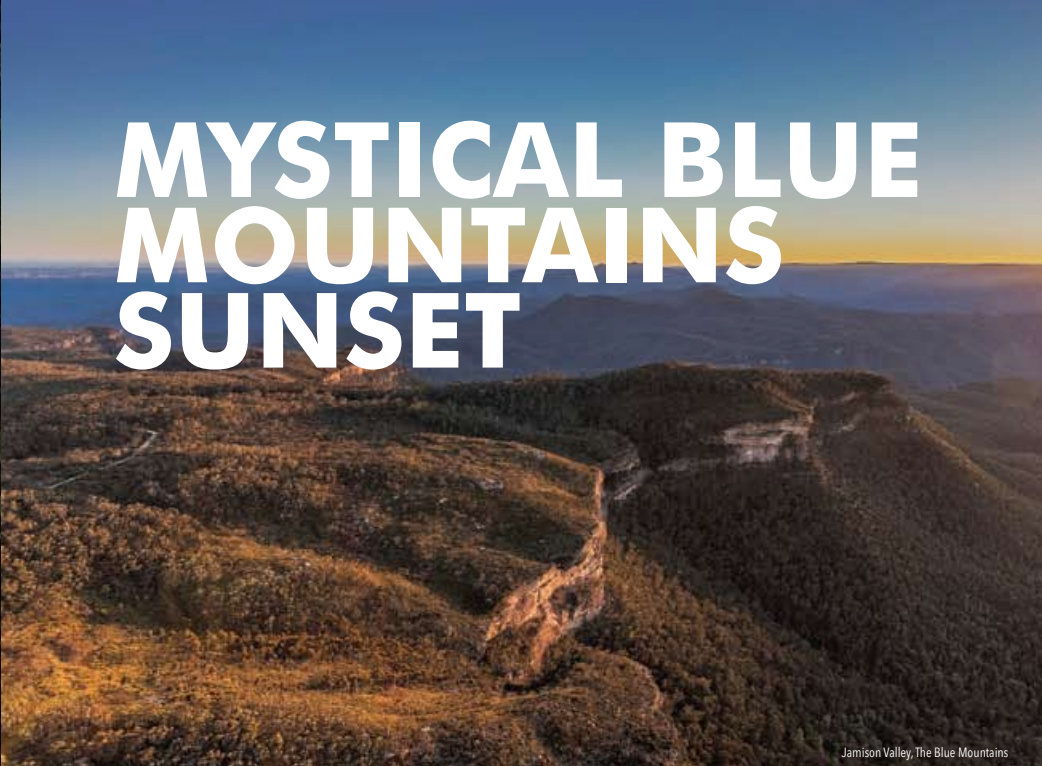
Jamison Valley, The Blue Mountains

Avoid the crowds on this relaxed exploration of the Blue Mountains! Explore a different side of the Blue Mountains in the late afternoon sunlight and capture the incredible sunset over the rugged ranges and valleys. With a late morning departure, you'll have extra time to enjoy Sydney before exploring this World Heritage listed National Park, home to a diverse range of flora and fauna.