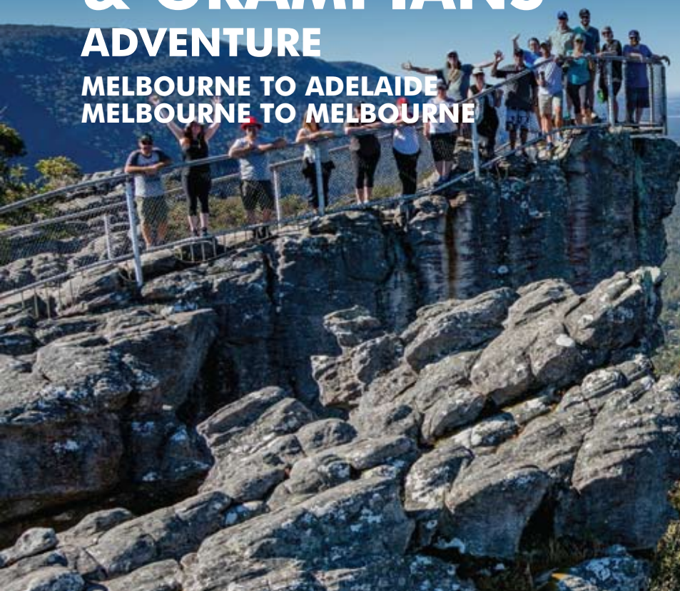
Pinnacle Lookout, The Grampians National Park

Spend 3 amazing days travelling along the Great Ocean Road & Grampians National Park adventure tour. Visit some stunning places including the 12 Apostles, Loch Ard Gorge, Mackenzie Falls, Halls Gap and other magnificent sights throughout the region. Choose between returning back to Melbourne or making your way through to Adelaide.