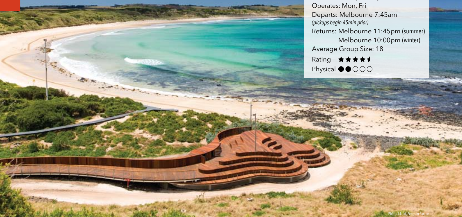
Phillip Island, Penguin Parade

Enjoy two of Melbourne's most popular destinations traveling against the crowds and staying overnight on the famous Great Ocean Road! On day two we'll jump on the ferry to transfer across Port Phillip Bay to spend the day getting up close with Australia's diverse wildlife on Phillip Island.